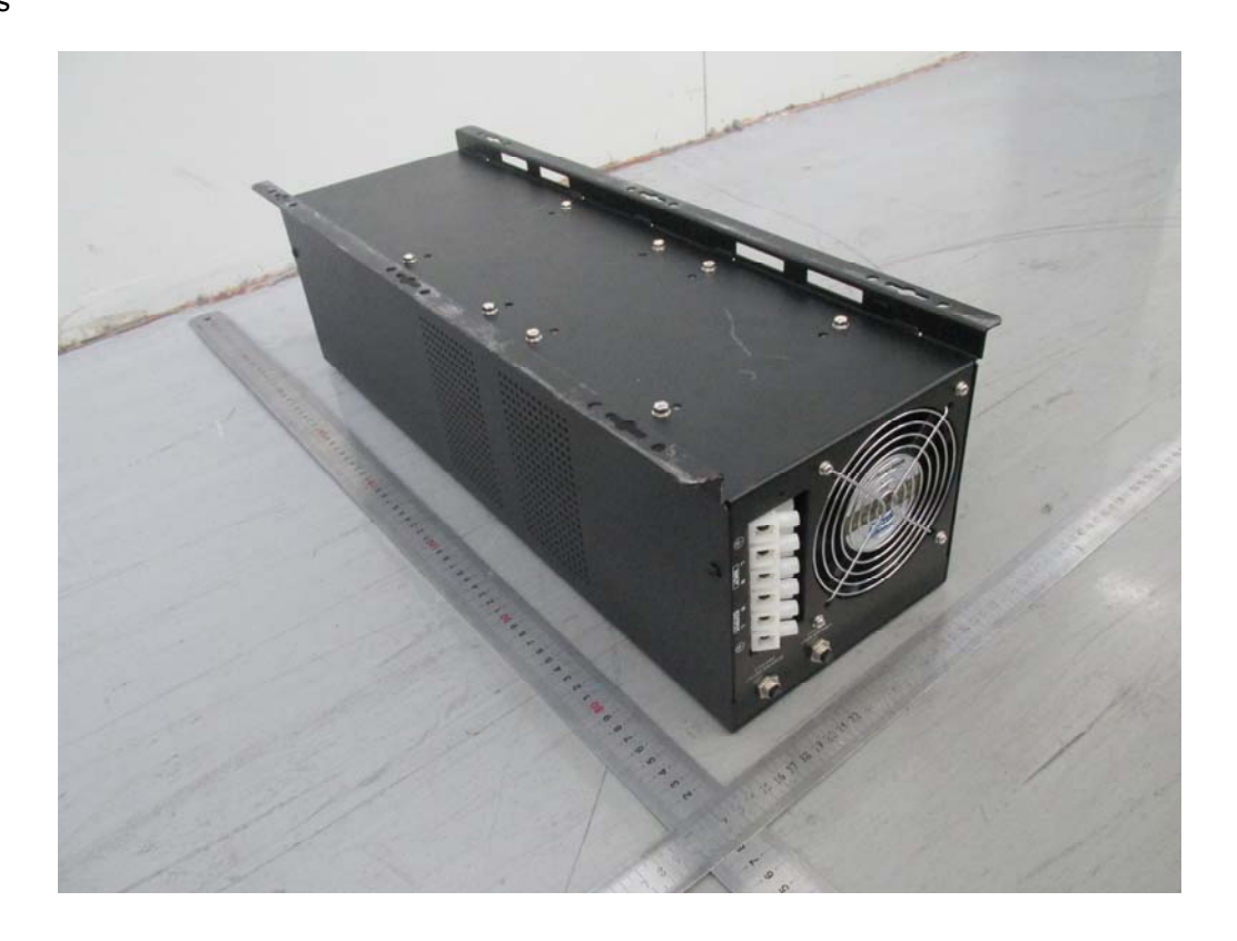
Fig. 2 – Overview (3)