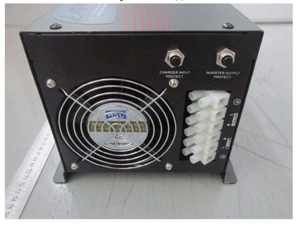
Fig. 3 – Overview (4)