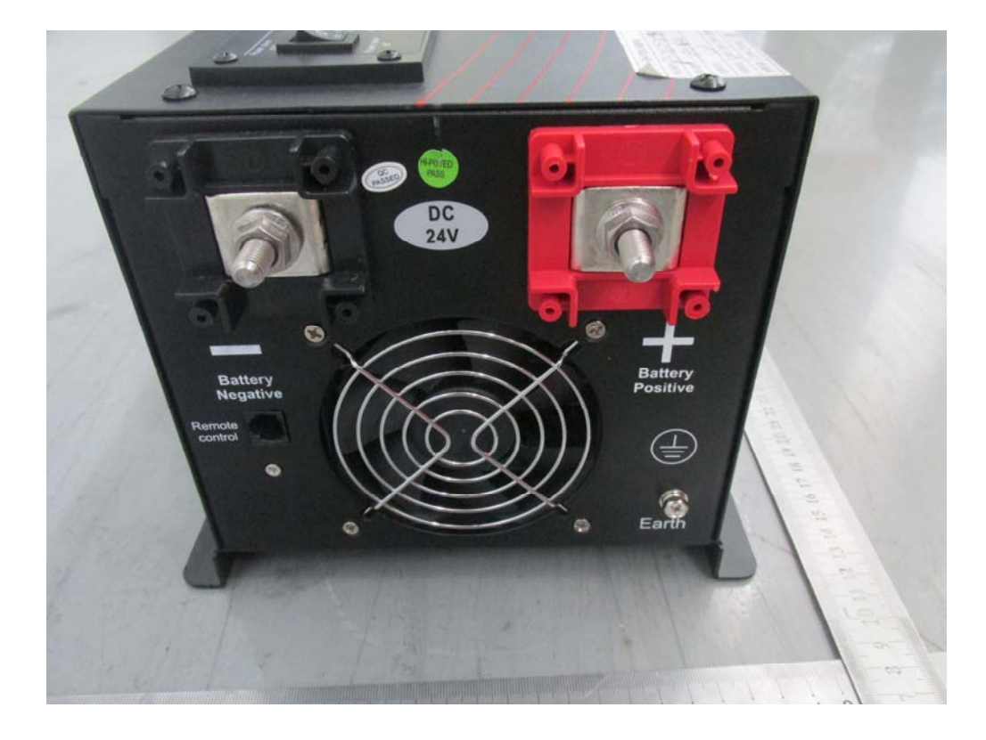
Fig. 4 – Overview (5)