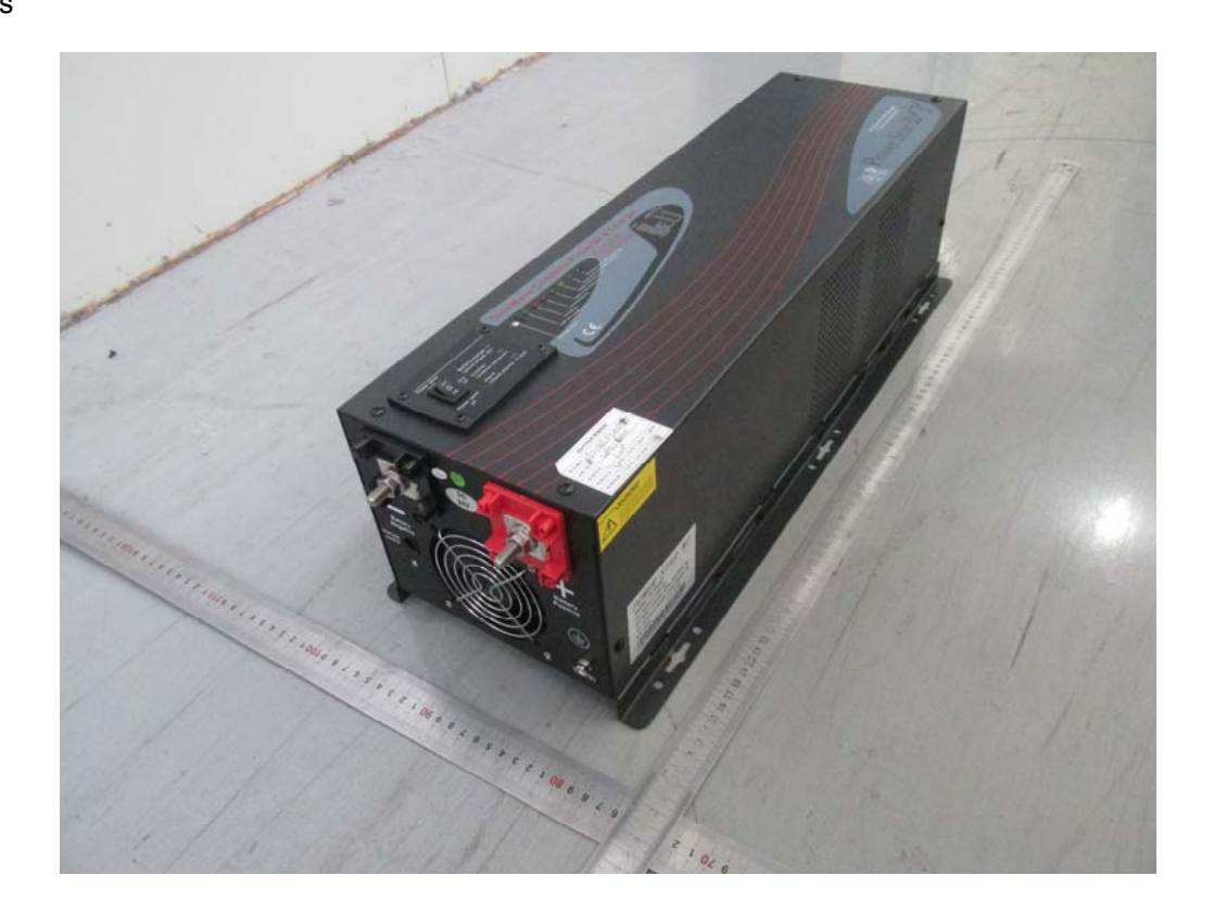
Fig. 1 – Overview (I)