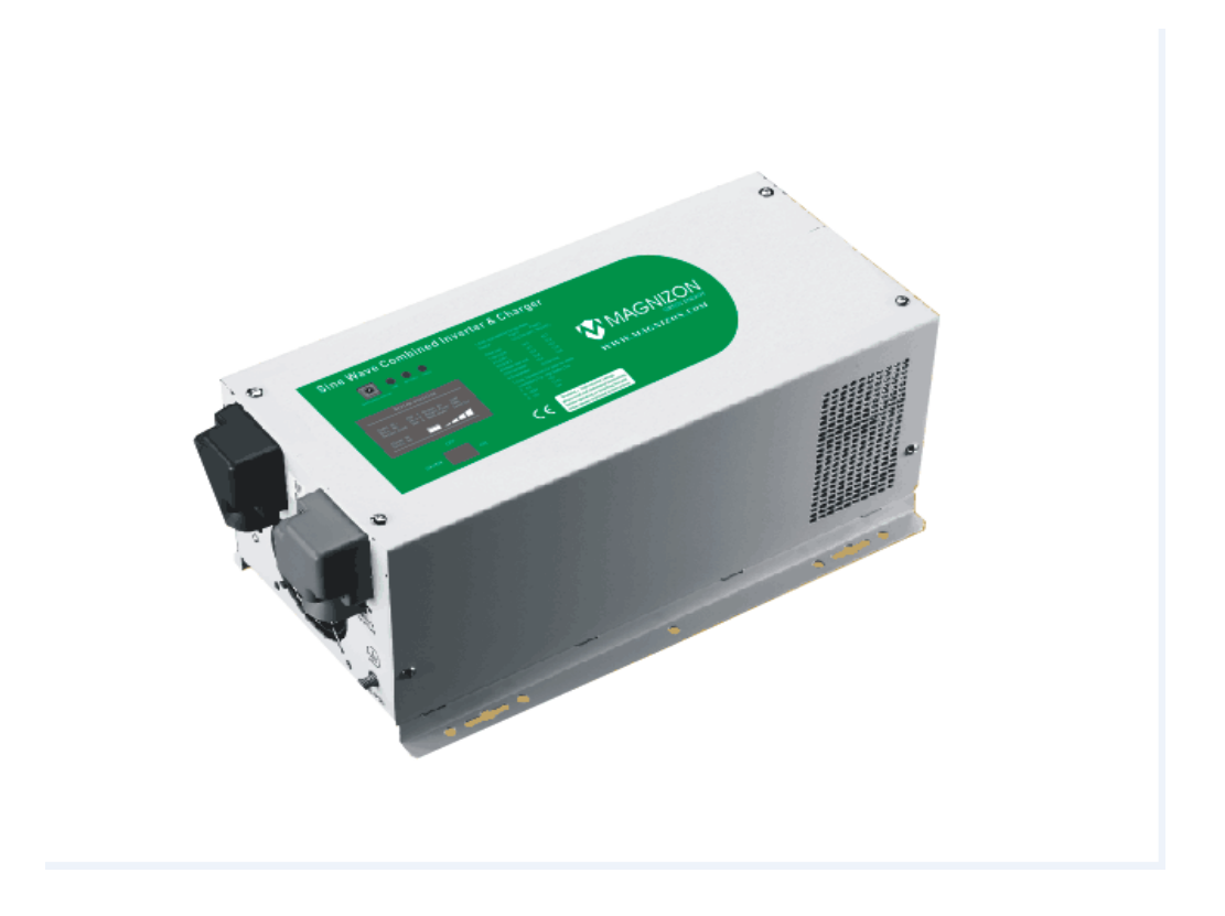
Fig. 2 – Overview (2)