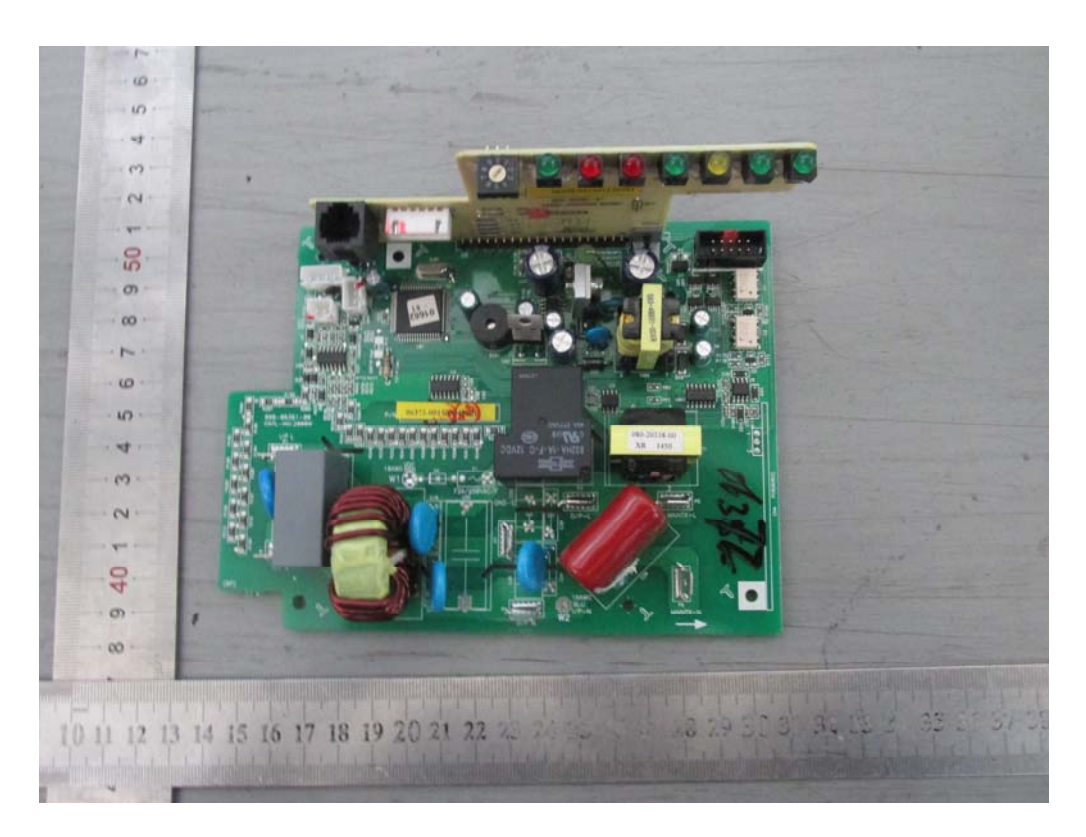
Fig. 6 -Power board view